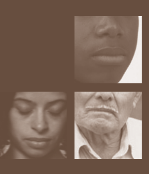
I called my doctor and talked about how I was feeling. She had me come in for a checkup and gave me the name of a specialist, who is an expert in treating depression.